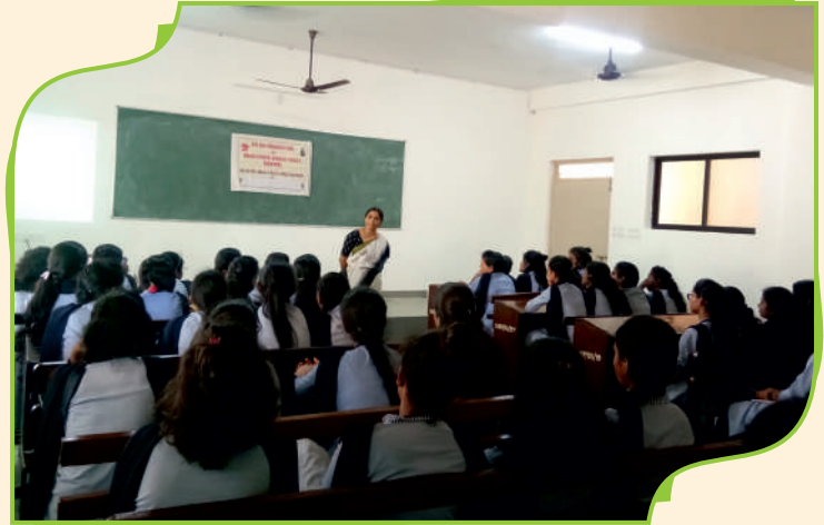
Students / Adolescents