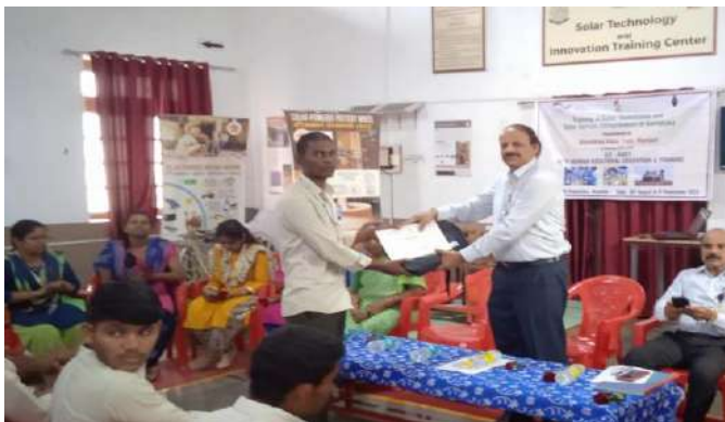
Figure 5 Certificate Distribution