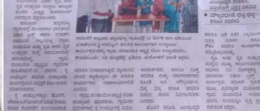
ಅಪರಾಧಿ ಮನವರಿಕೆಗಾಗಿ ವಾರಸುದಾರ ದಂಡ ಕಟ್ಟಬೇಕೆಂದು...