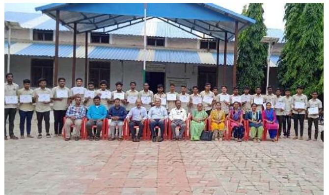
Figure 6 Group Photo