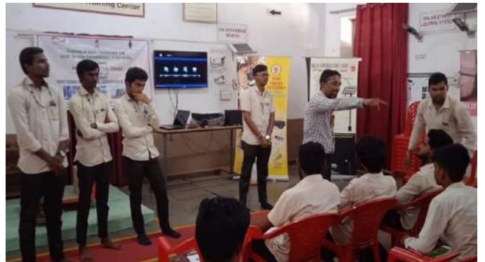
Figure 1 Theory Session