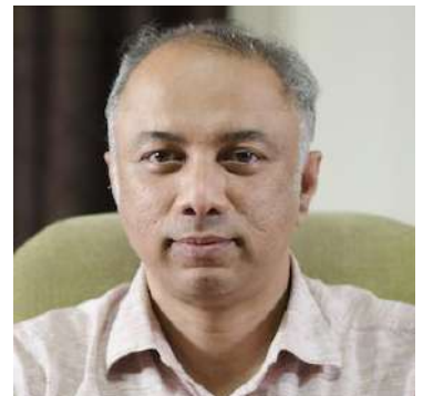
Dr. Harish Hande Trustee